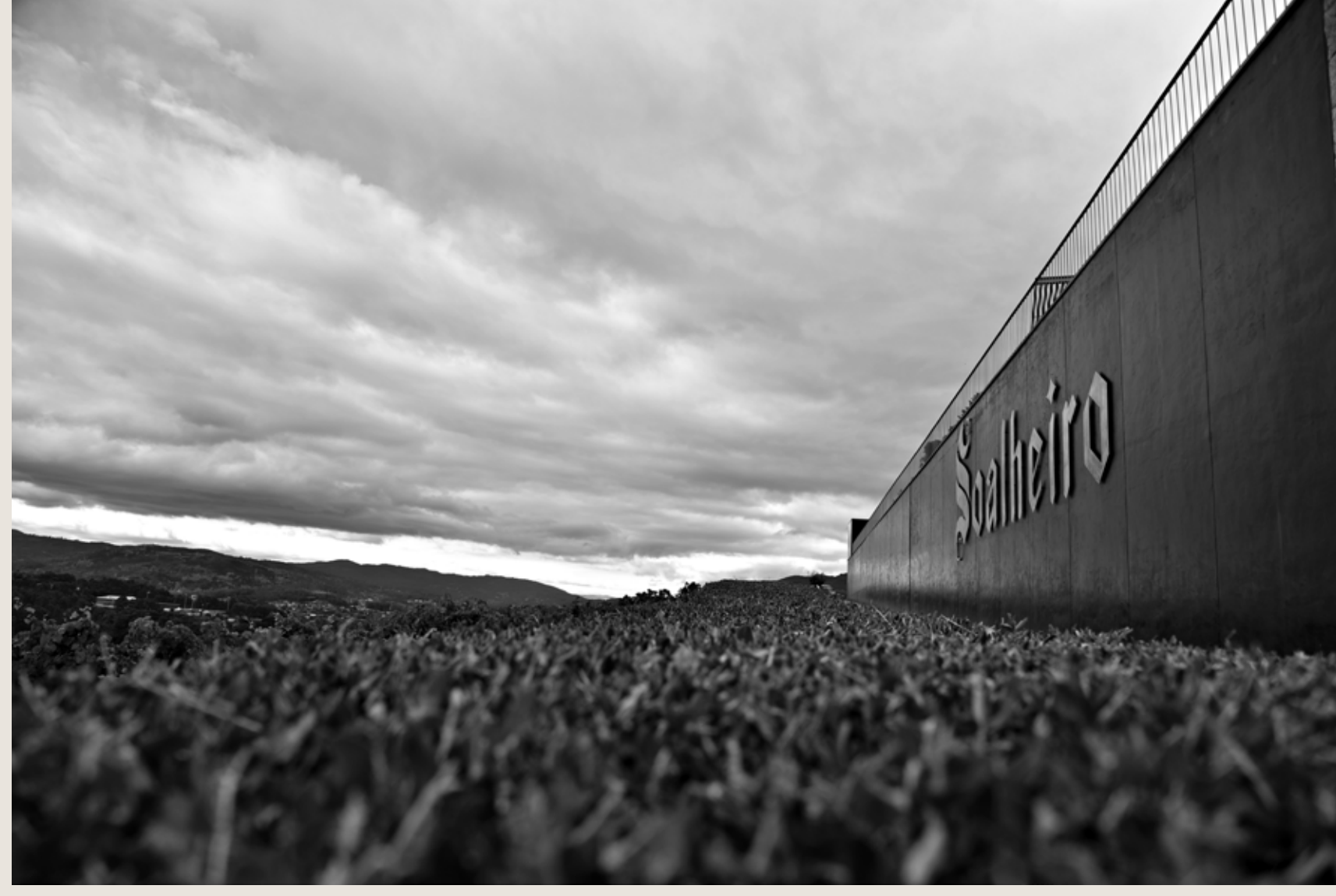
1st Place: "Mundo" by Carlos Elísio