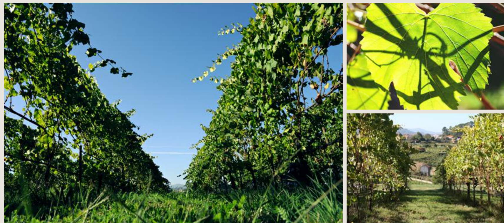
2nd place: "Vassalagem à serra" by Lídia Faria